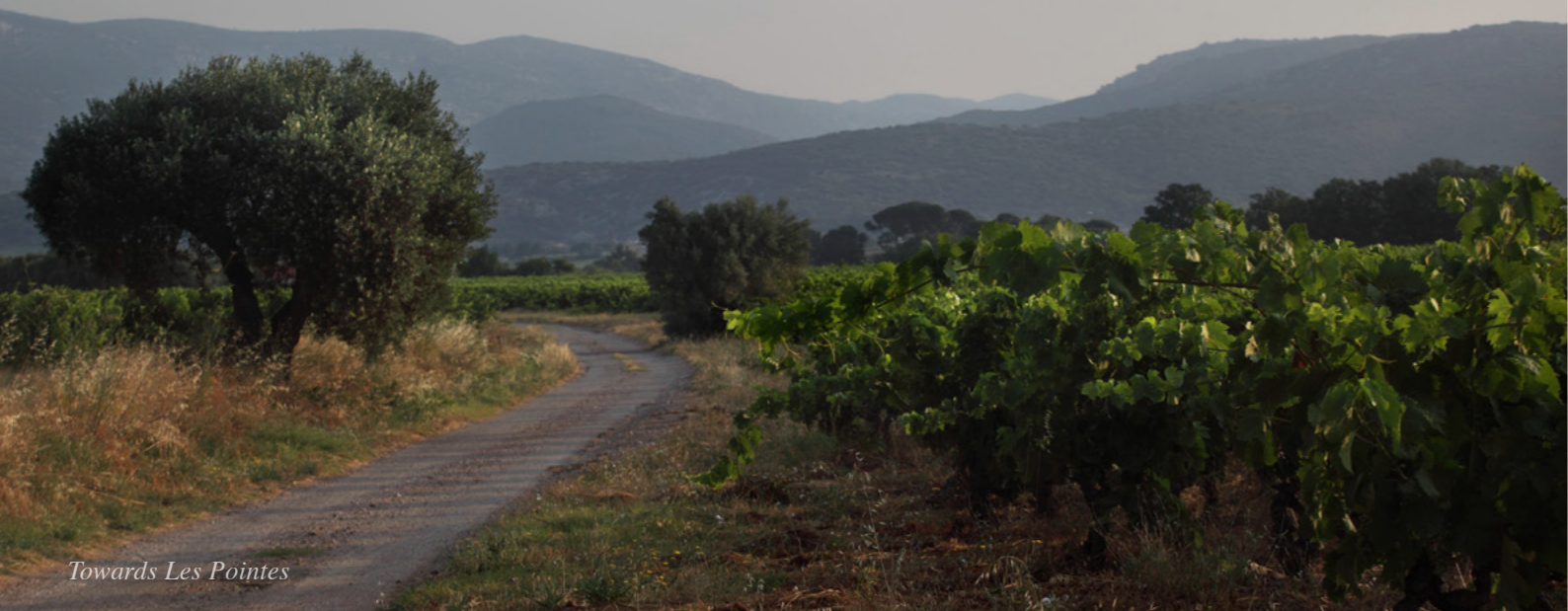
Towards Les Pointes